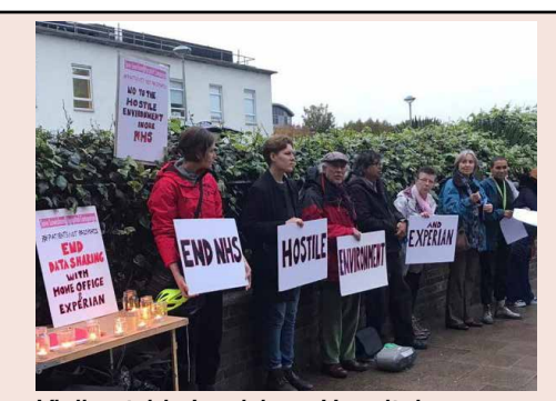
Vigil outside Lewisham Hospital

feel cramps when I sit down, when I get up I can hardly walk sometimes. A lot of clots... I am scared to go to the hospital because I don't know how I will be able to pay. Even just to hear what caused the death of my baby. I am just thinking 'was I stressed?', 'was I not eating well?', 'was it a time I slipped on the stairs?' Or was it a medical problem? I don't know."